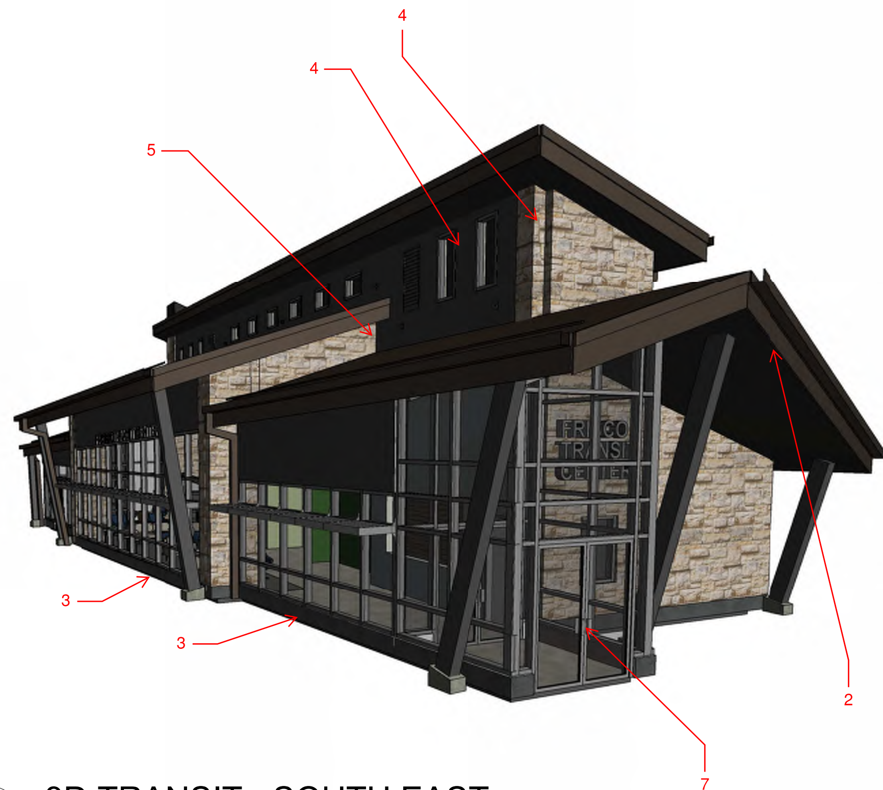
1 3D TRANSIT - SOUTH EAST