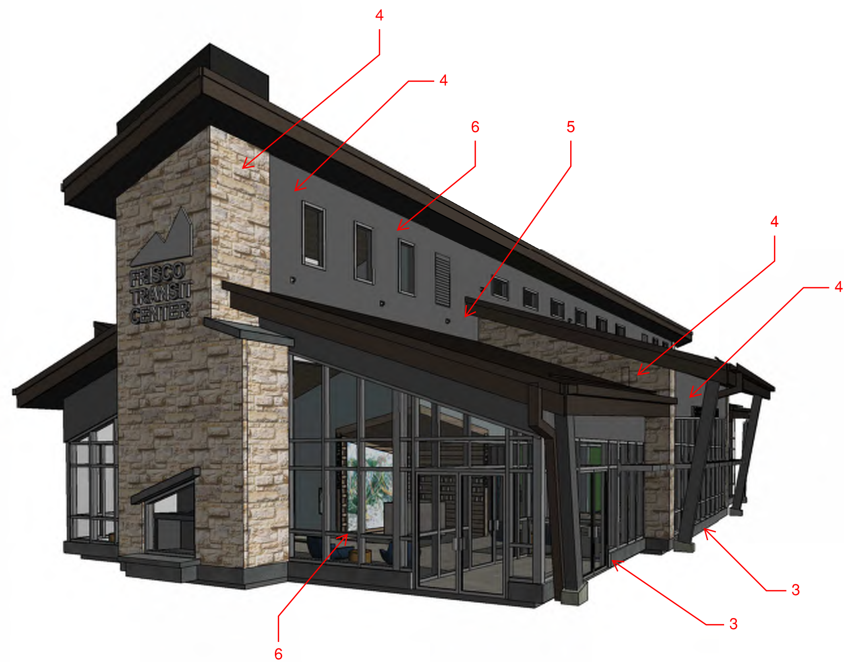
2 3D TRANSIT - SOUTH WEST