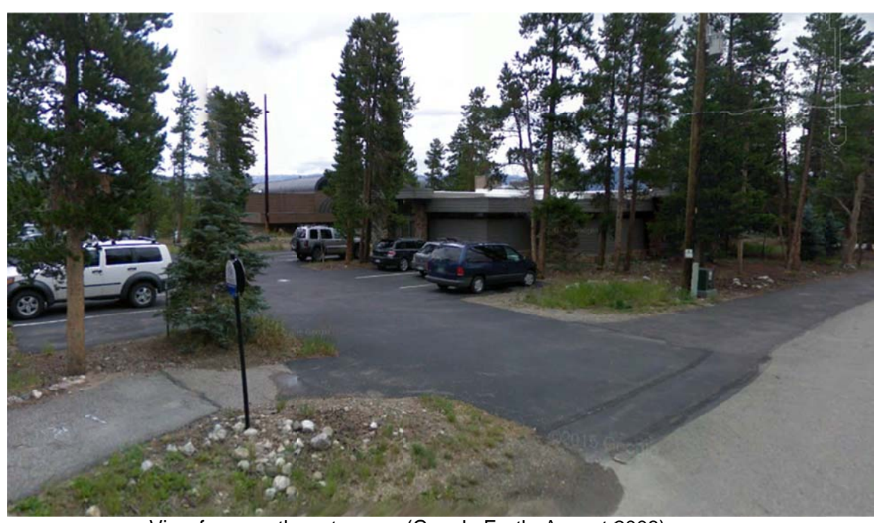
View from southwest corner (Google Earth, August 2008)