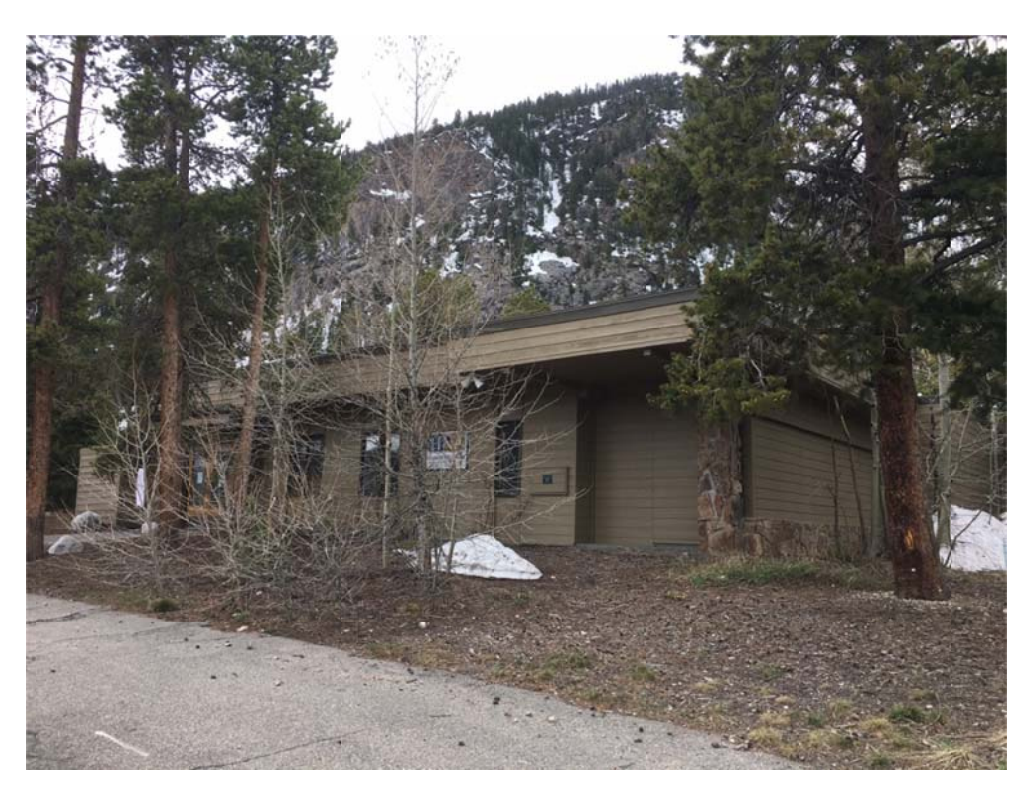
View from northeast corner (April 20, 2017)