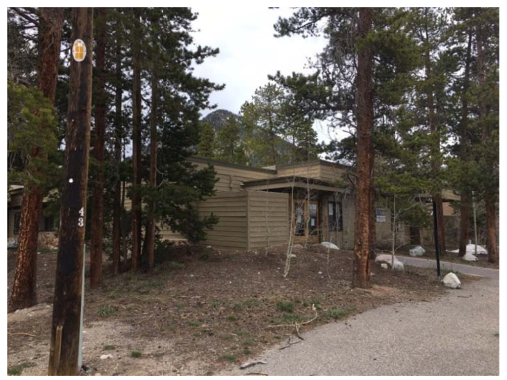
View from southeast corner (04/20/2017)