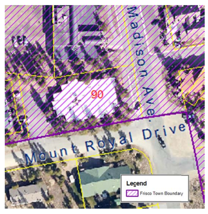
Town of Frisco Boundary