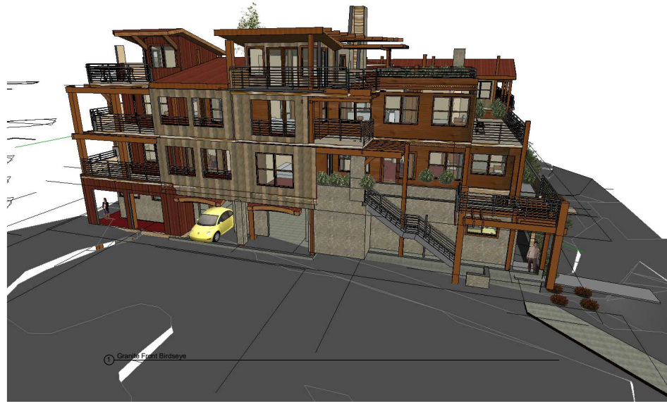
1 Granite Front Birdseye

ARCHITECTURAL INNOVATORS INC. BOX 30 IDAHO SPRINGS, CO. 80452 303-567-0100