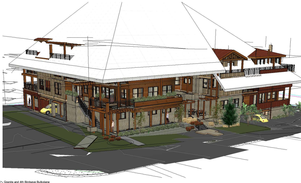
① Granite and 4th Birdseye Bulkplane

ARCHITECTURAL INNOVATORS INC. BOX 30 IDAHO SPRINGS, CO. 80452 303-567-0100