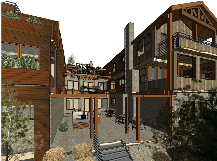
① Courtyard Pedestrian

ARCHITECTURAL INNOVATORS INC. BOX 30 IDAHO SPRINGS, CO. 80452 303-567-0100