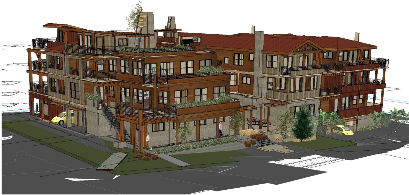
Granite and 4th Birdseye

ARCHITECTURAL INNOVATORS INC. BOX 33 IDAHO SPRINGS, CO. 80452 303-567-0100