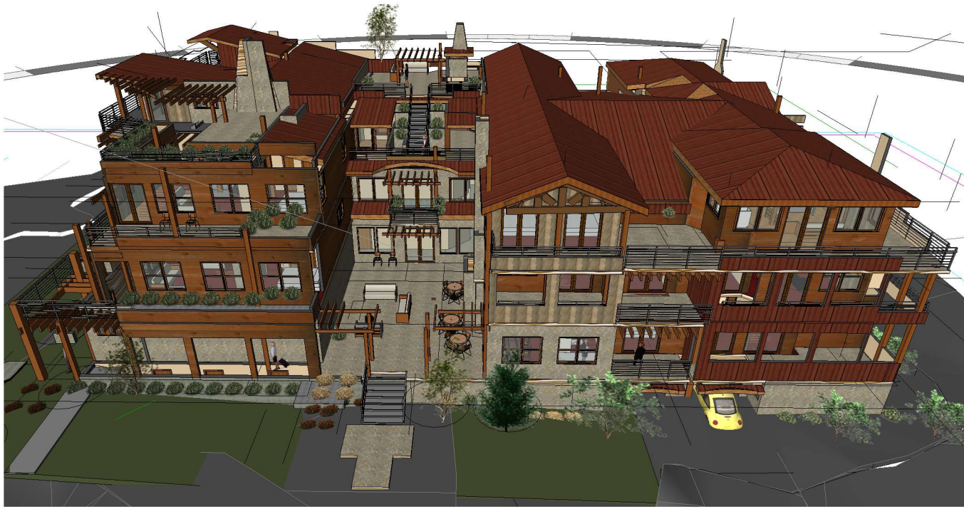
① Courtyard Birdseye

ARCHITECTURAL INNOVATORS INC. BOX 30 IDAHO SPRINGS, CO. 80452 303-567-0100