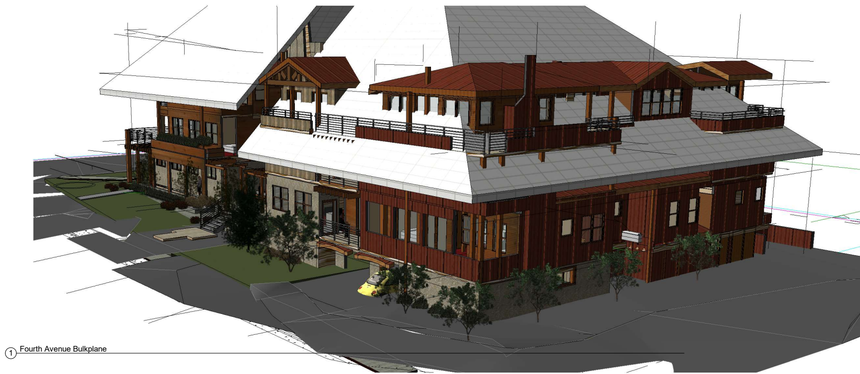
① Fourth Avenue Bulkplane