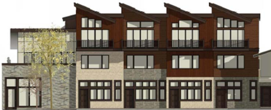
West Façade of Addition: March 21, 2019

The proposed building contains four (4) residential units. As can be seen in the below pictures, the applicant has made changes to the west façade of the new addition so that the four units are not identical. Changes made include variation in windows and changes in colors and materials.