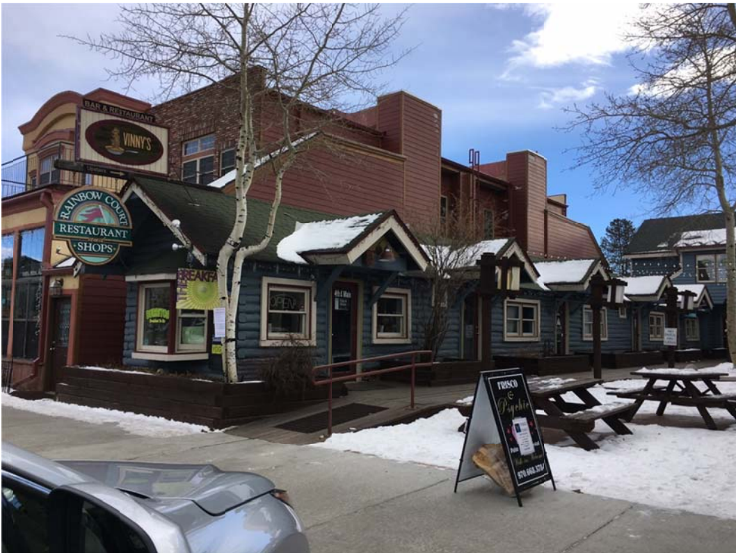
Interior View of the East Wing