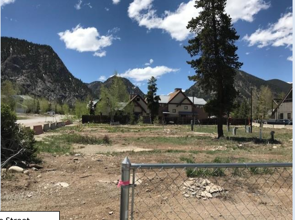
619 Granite Street