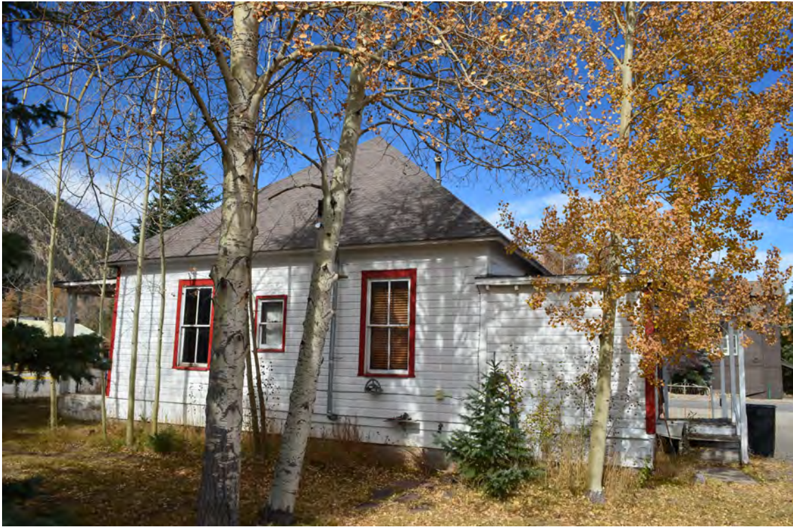
5ST.1744 • Susie Thompson House Looking Northwest Image: 120.N4th.9