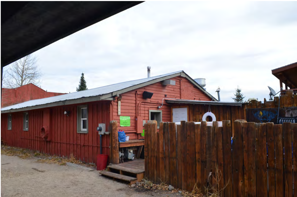
5ST.1761 • Moose Jaw Cafe Looking Northeast Image: 208.MAI.5