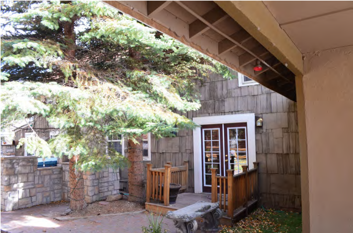
5ST.282 • Frisco Lodge Looking East Image: 321.MAI.8