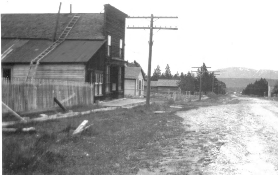
5ST.282 • Frisco Lodge, original facade Looking East Image: 321.MAI.13

Summit County, Colorado date unknown