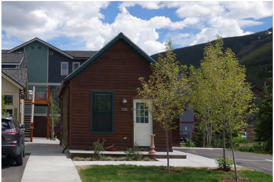
5ST.1753 • Mary Ruth House Looking South