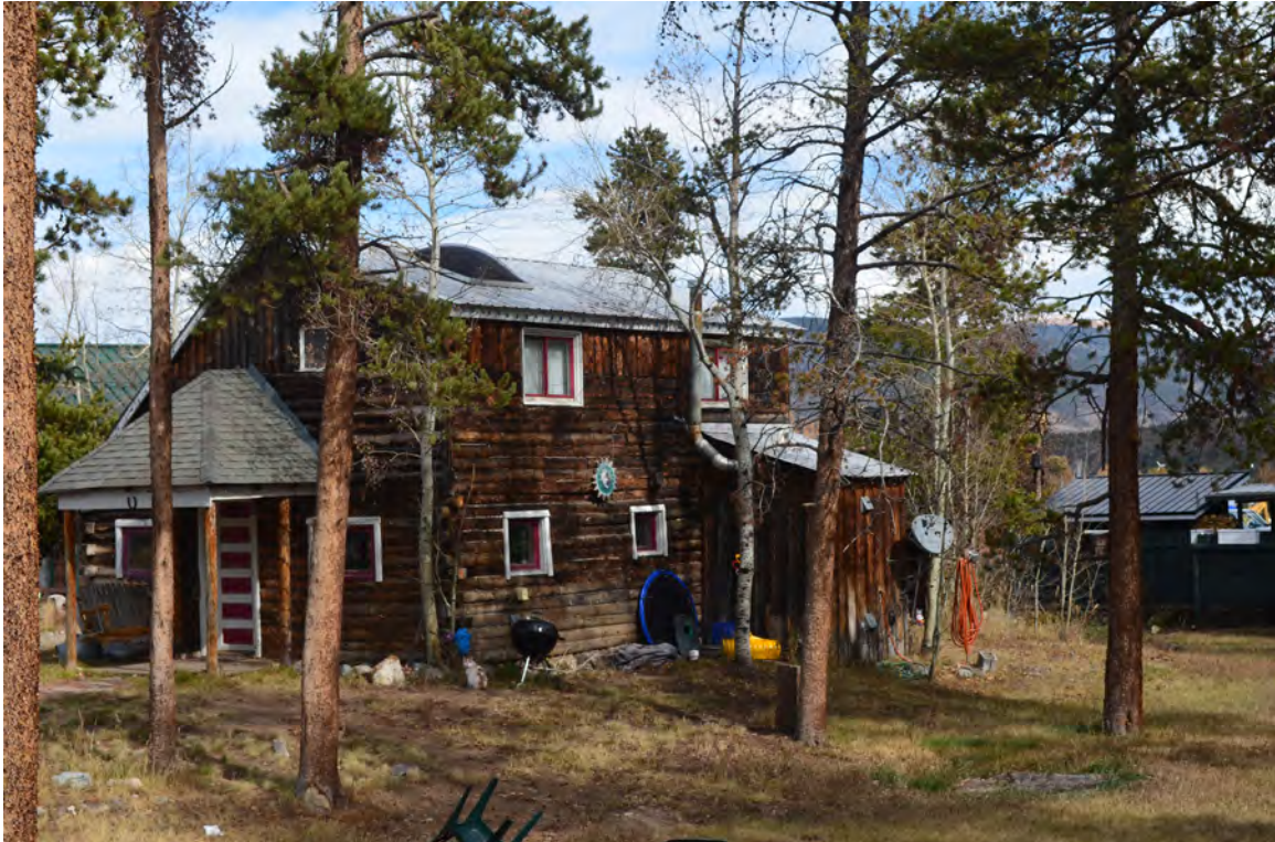
5ST.1748 Looking Northeast Image: 212.N6th.6