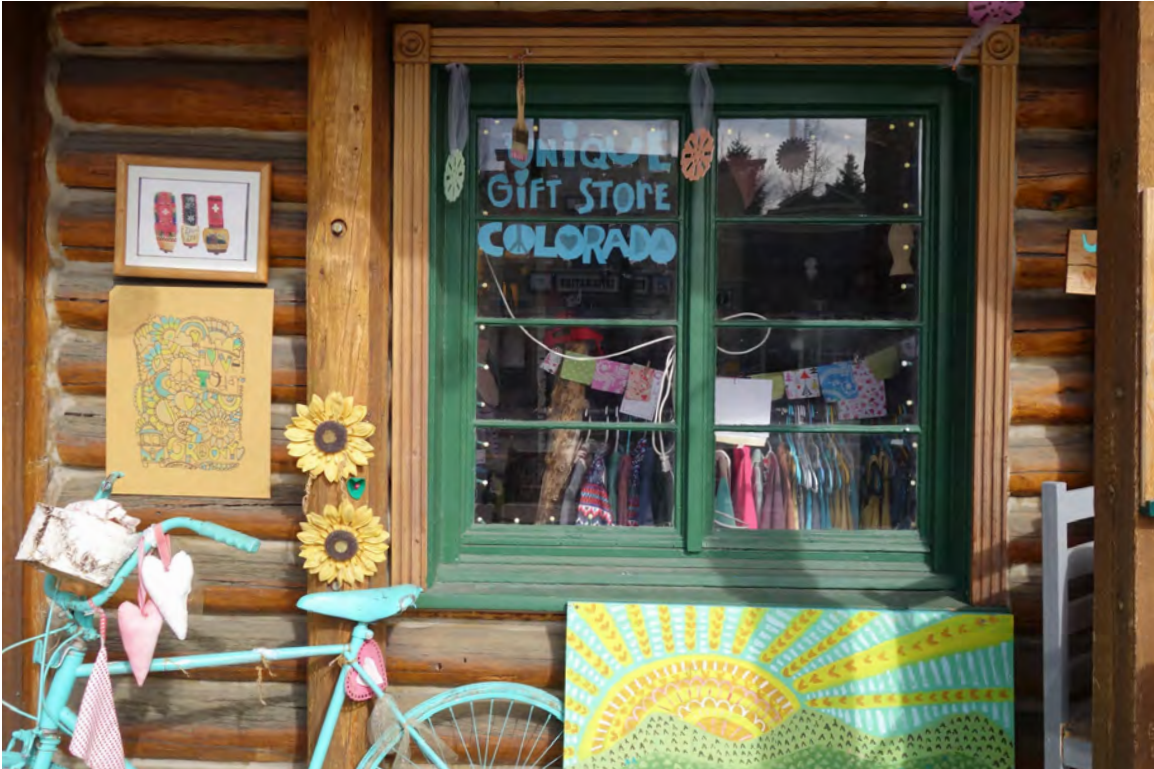
5ST.1762 Looking North, detail Image: 301.MAI.6