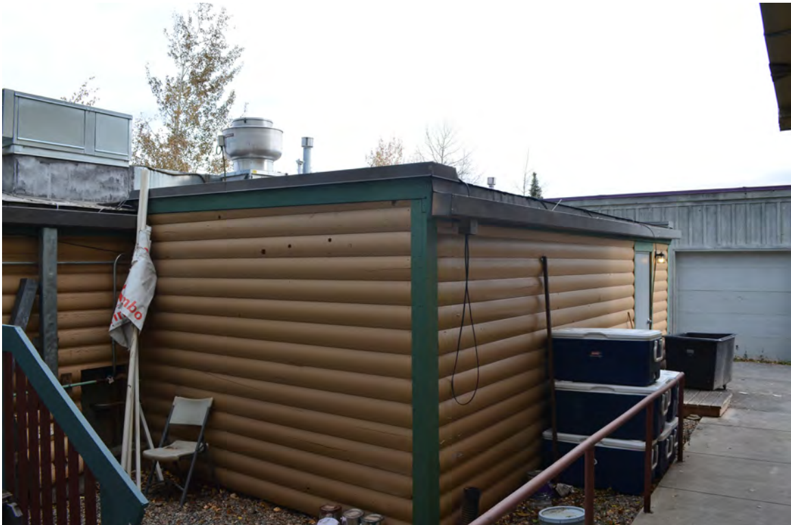
5ST.1760 • Lost Cajun Cafe Looking Northeast Image: 204.MAI.7