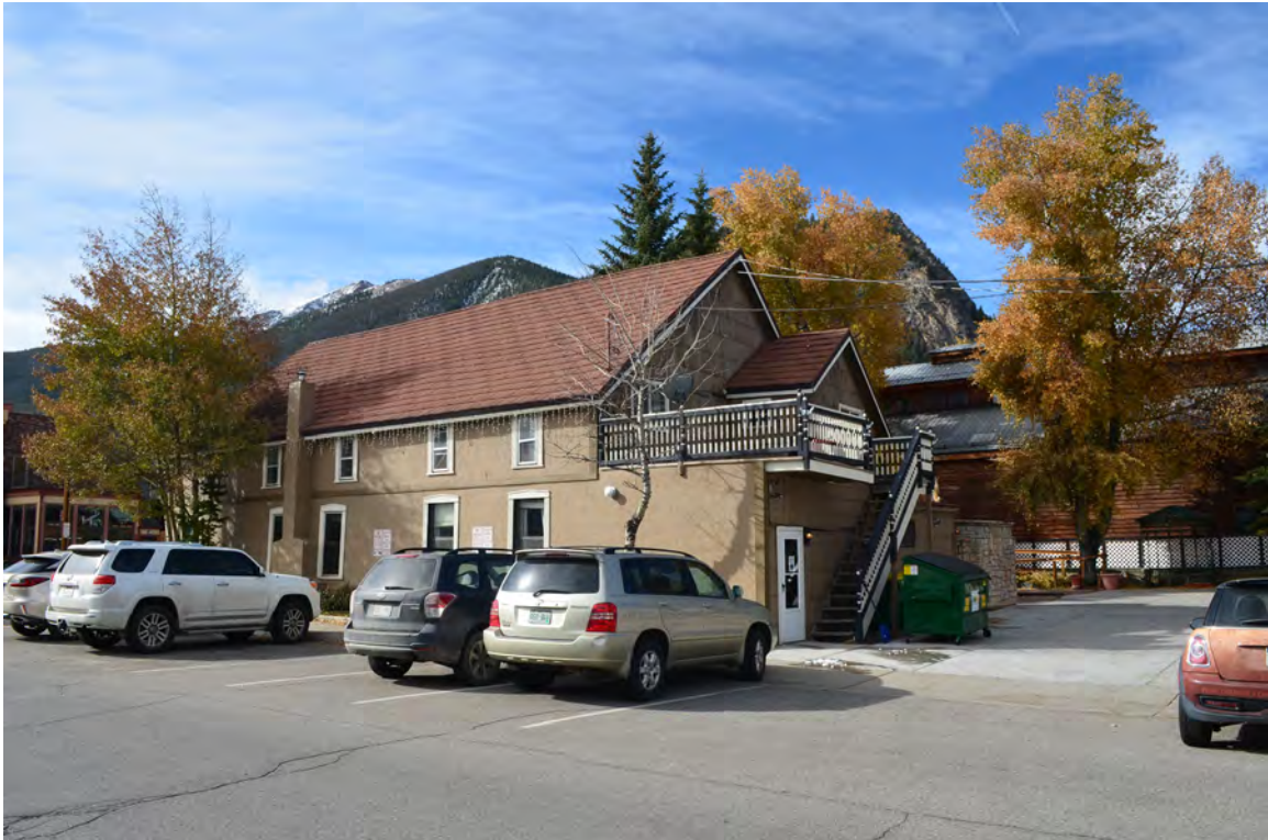
5ST.282 • Frisco Lodge Looking Southwest Image: 321.MAI.5