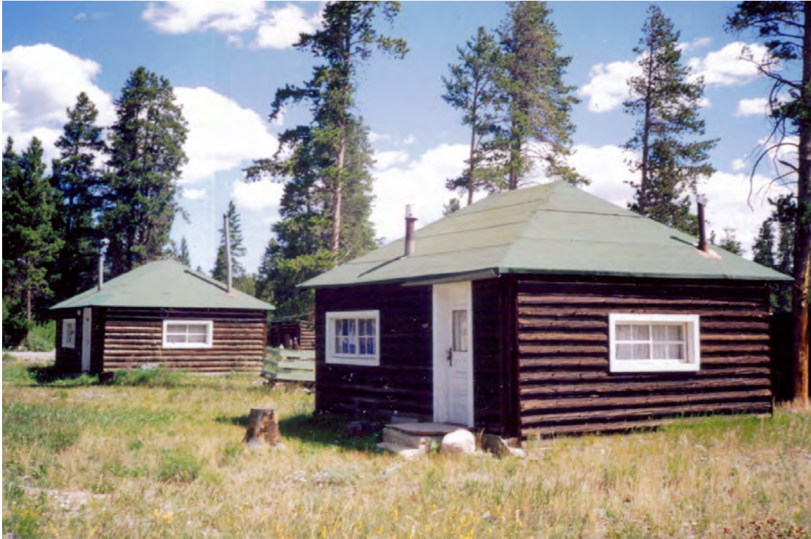
5ST.1746 • Deming Cabin Looking Northeast, 112, foreground and 116 back Image: 116.N5th.2

Summit County, Colorado Date Unknown