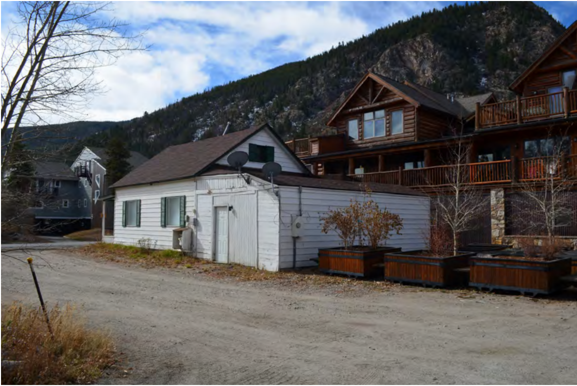
5ST.1757 • Wiley House Looking Southwest Image: 113.GRA.7