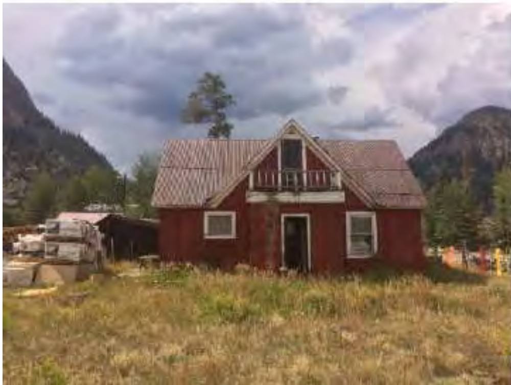
5ST.1766 • Excelsior Mine Office Appears to be looking West Image: EXCL.6

Summit County, Colorado date unknown