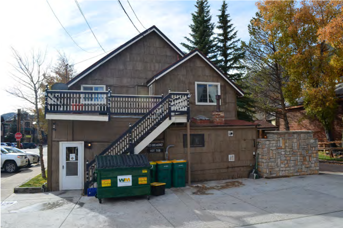
5ST.282 • Frisco Lodge Looking South Image: 321.MAI.6