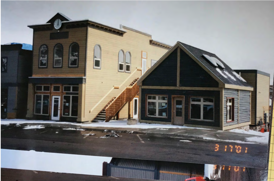
5ST.1760 • Lost Cajun Cafe Associated Buildings Looking East Image: 204.MAI.8

Summit County, Colorado March, 2001