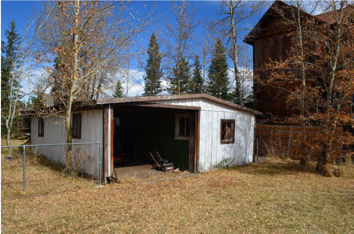
5ST.1744 • Susie Thompson House, outbuilding 1 Looking Northeast Image: 120.N4th.10