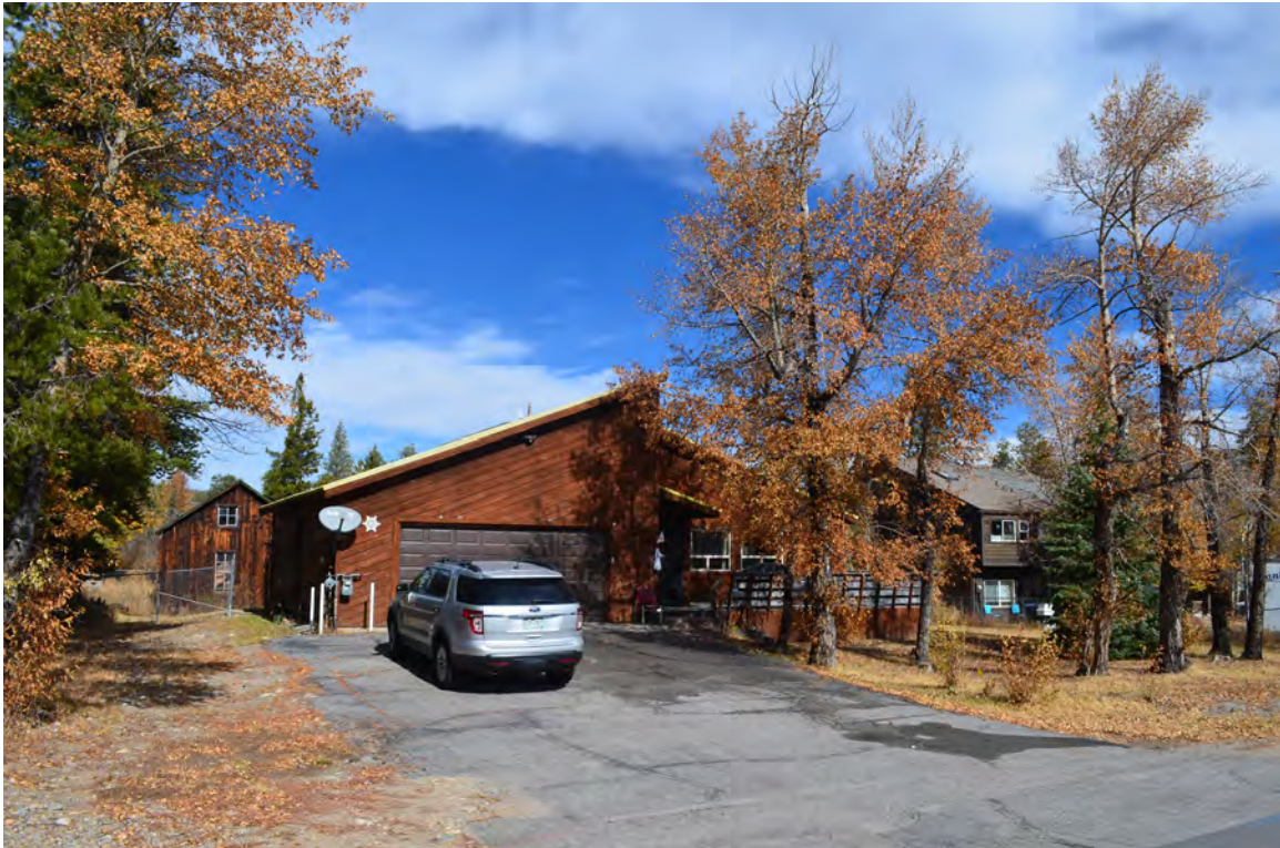
5ST.1754 • Giberson Barn Looking Southwest Image: 313.GAL.5