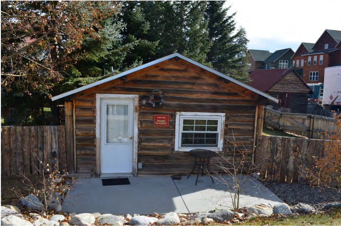
5ST.1763 • Cannam Cabins Cabin 2 Looking East Image: 502a.MAI.5