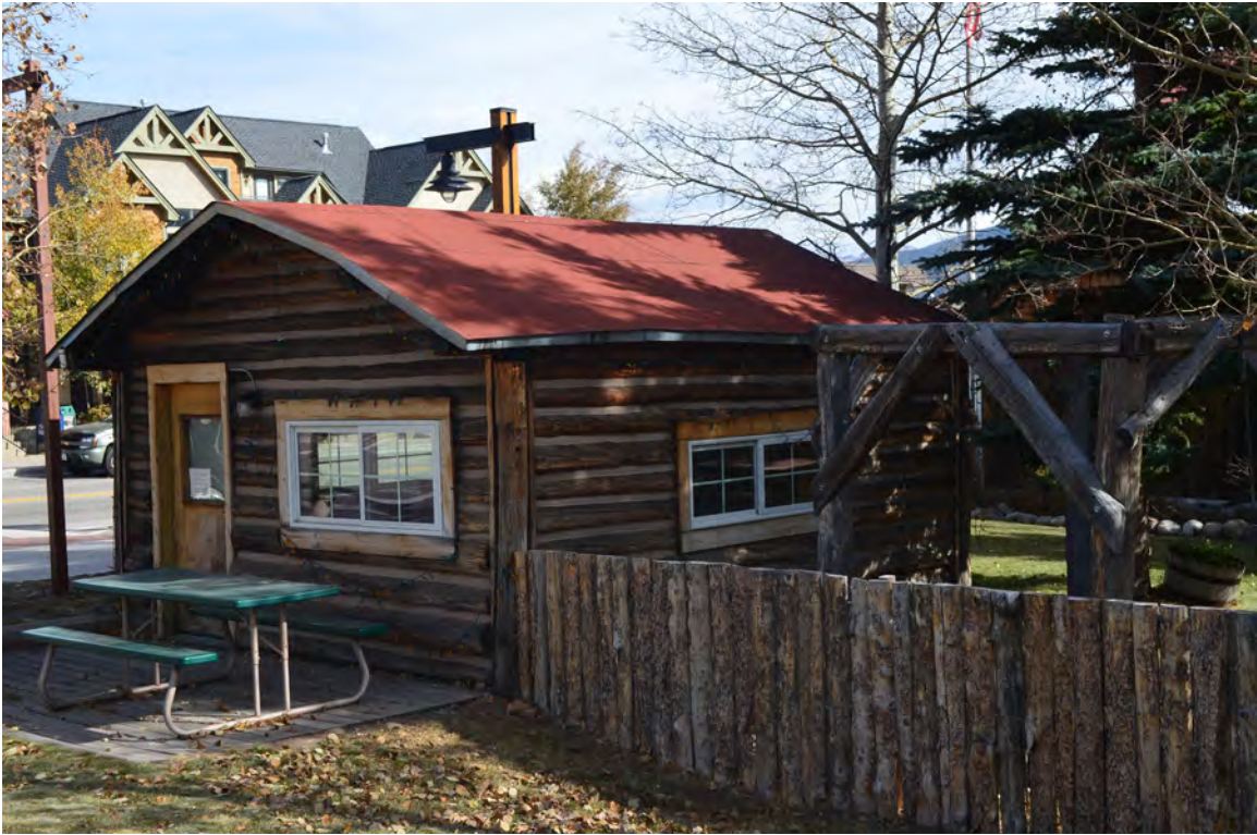
5ST.1763 • Cannam Cabins Cabin 1 Looking Northeast Image: 502a.MAI.3