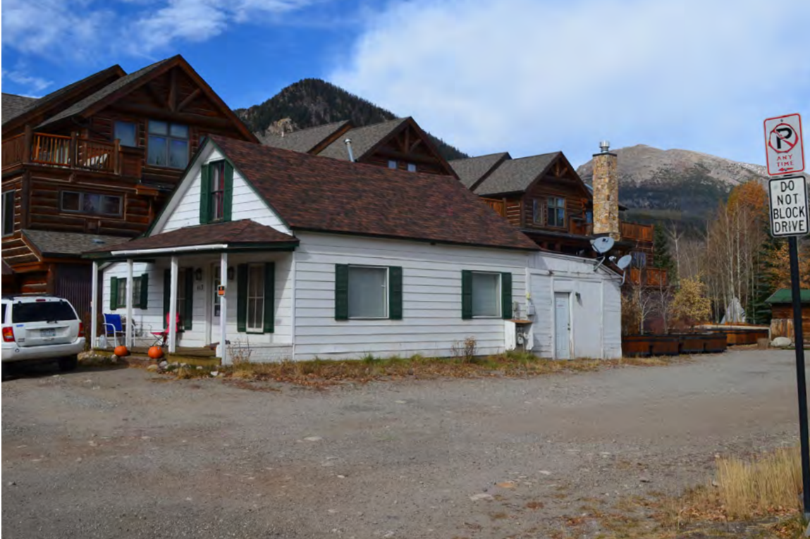
5ST.1757 • Wiley House Looking Northwest Image: 113.GRA.4

Summit County, Colorado 1922