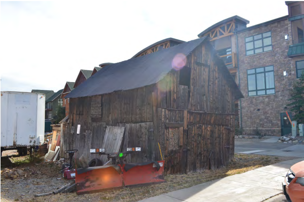
5ST.1764 • Blacksmith Shop Looking Southeast Image: 502b.MAI.3