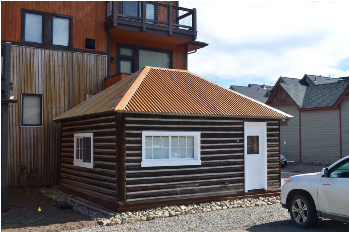
5ST.1745 • Deming Cabin Looking Southeast Image: 112.N5th.7