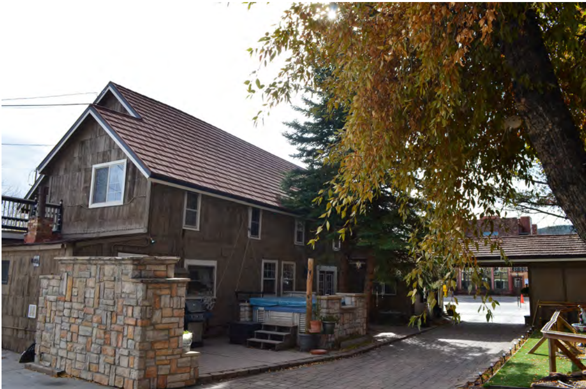
5ST.282 • Frisco Lodge Looking Southeast Image: 321.MAI.7