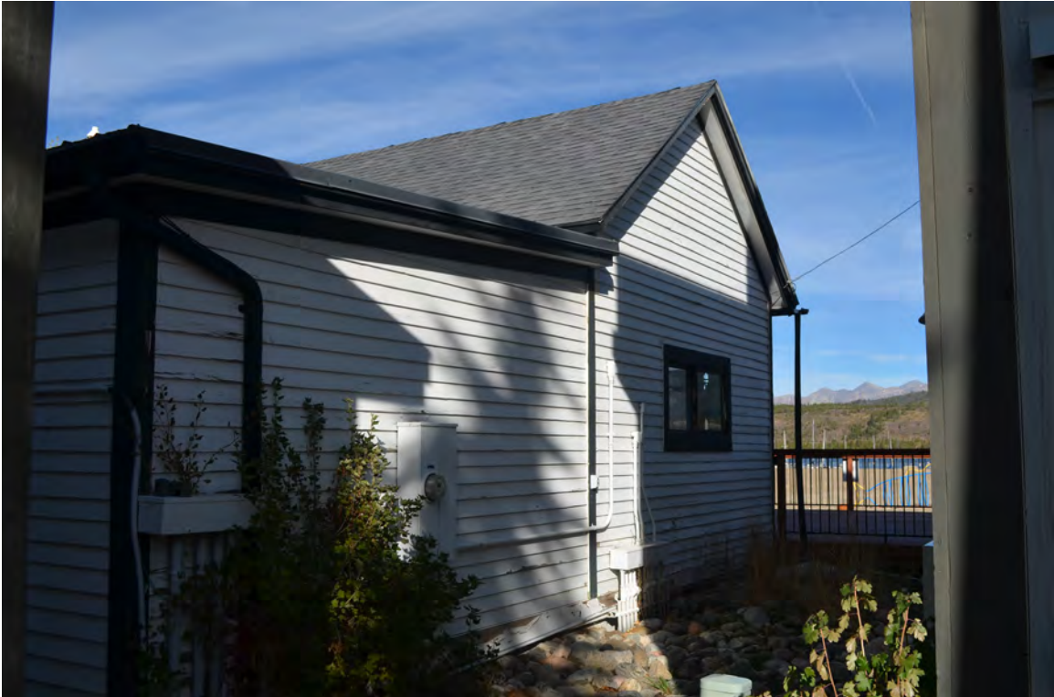
5ST.1765 • Lund House Looking Northeast Image: 267.MAR.6