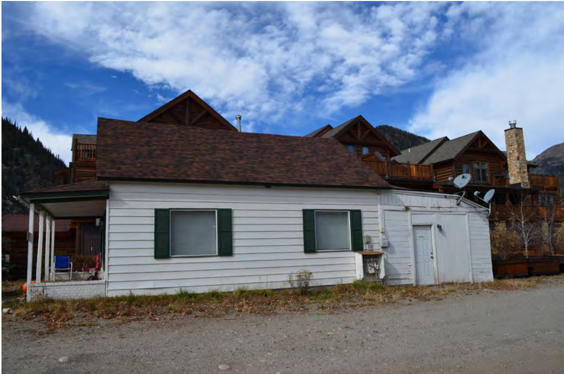
5ST.1757 • Wiley House Looking West Image: 113.GRA.5