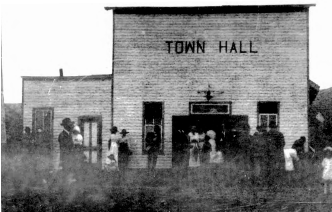
5ST.1073 • Historic Frisco Town Hall Looking South Image: 300.MAI.8

Summit County, Colorado date unknown