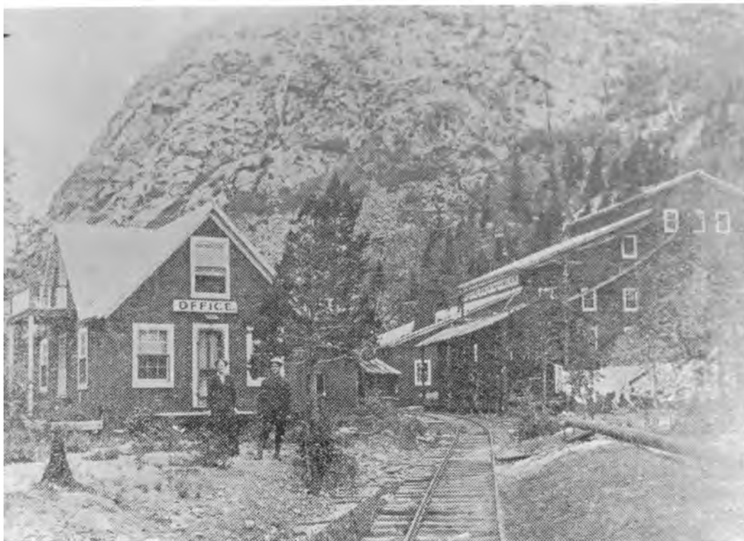
5ST.1766 • Excelsior Mine Office Unknown view direction Image: EXCL.7

Summit County, Colorado date unknown