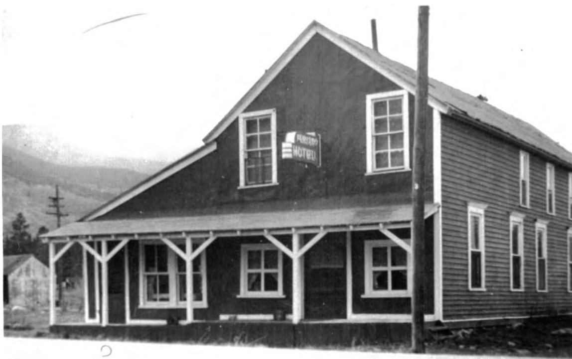
5ST.282 • Frisco Lodge, original facade Looking North Image: 321.MAI.14

Summit County, Colorado date unknown