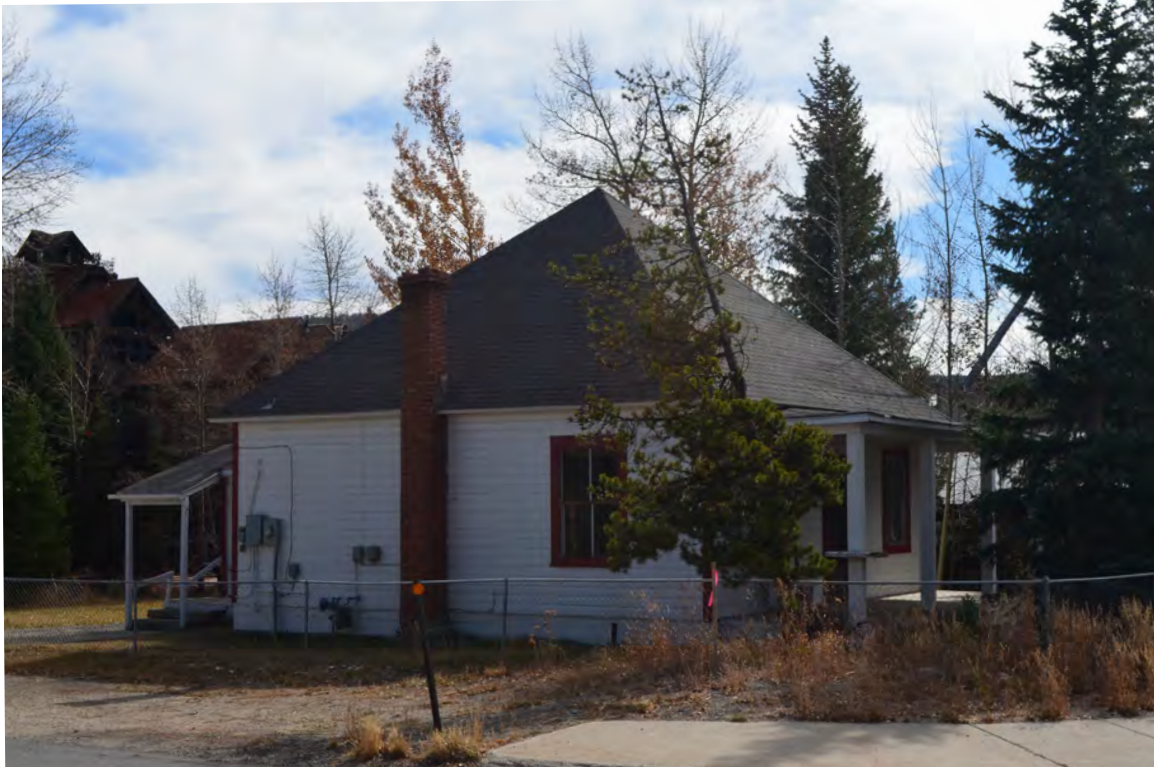
5ST.1744 • Susie Thompson House Looking Southeast Image: 120.N4th.4