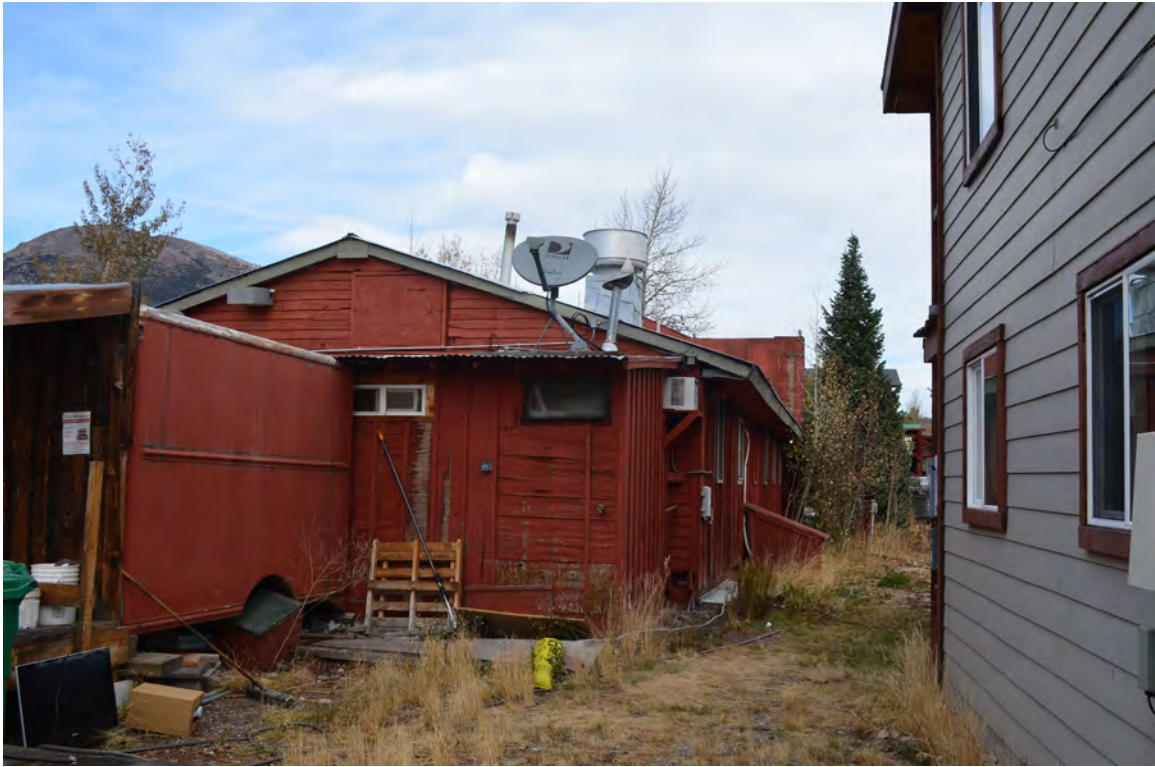
5ST.1761 • Moose Jaw Cafe Looking North Image: 208.MAI.7