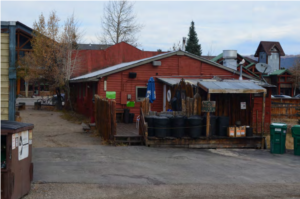
5ST.1761 • Moose Jaw Cafe Looking North Image: 208.MAI.6