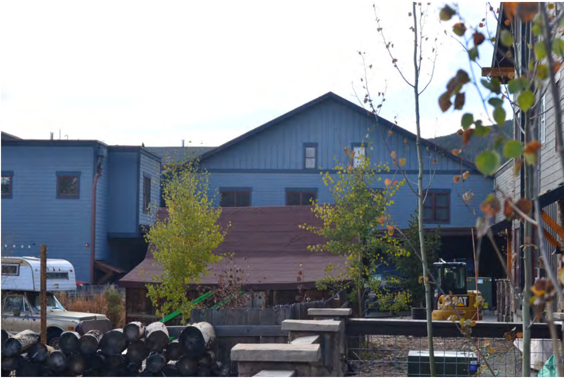
5ST.1751 • Mumford House Looking South Image: 212.GAL.7