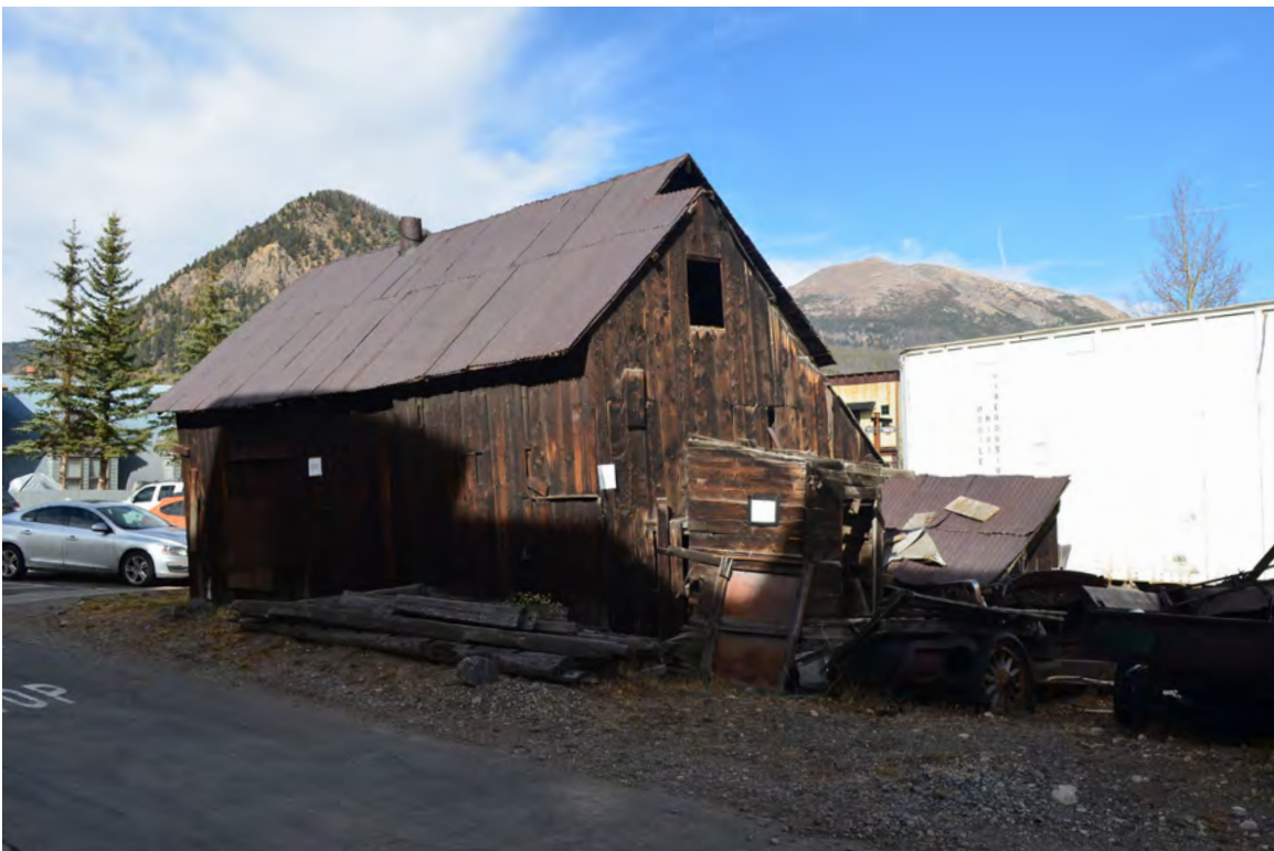
5ST.1764 • Blacksmith Shop Looking Northwest Image: 502b.MAI.4