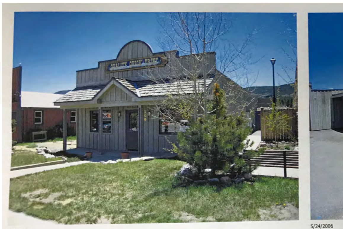
5ST.1760 • Lost Cajun Cafe Associated Buildings Looking Southeast Image: 204.MAI.10

Summit County, Colorado May, 2006