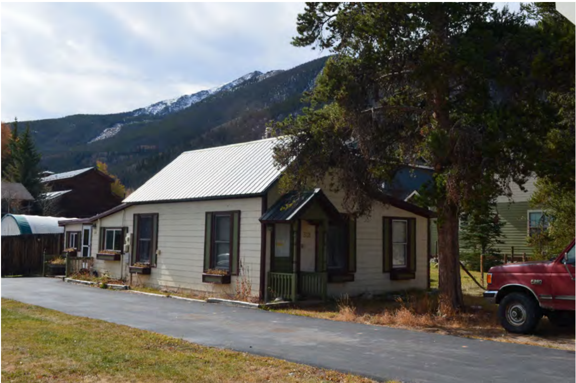
5ST.1755 • Morris House Looking Southwest Image: 318.GAL.4