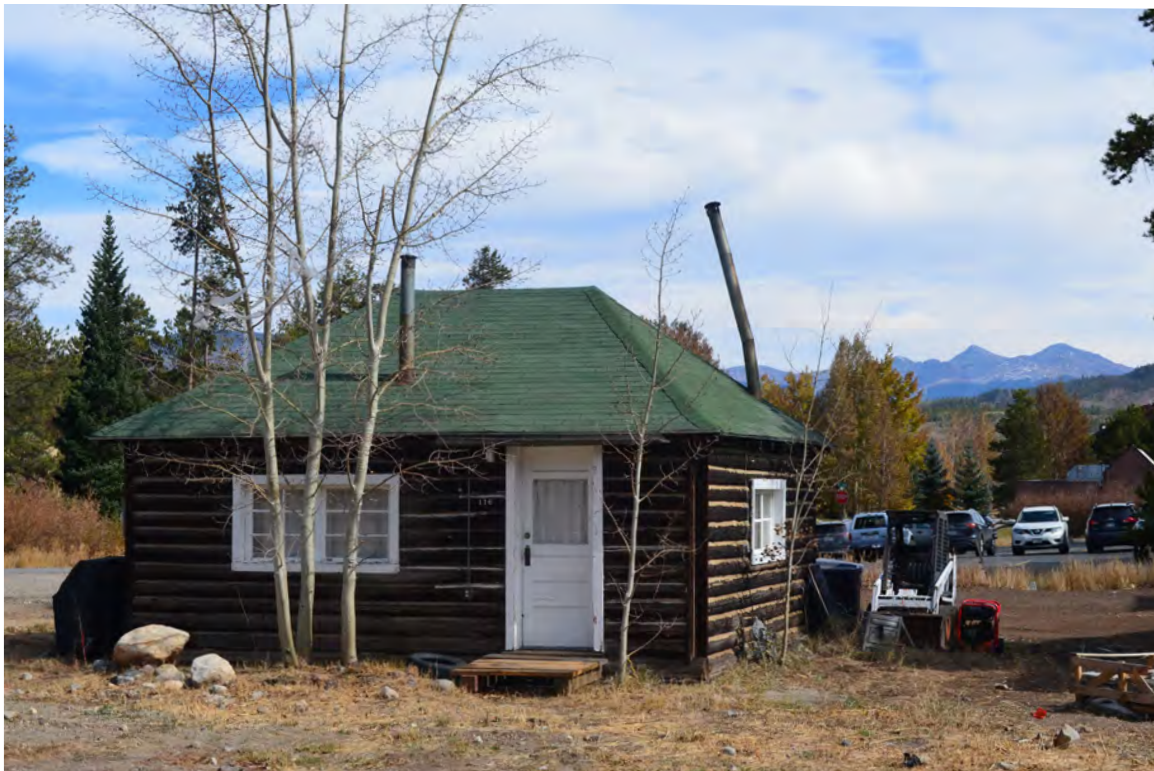
5ST.1746 • Deming Cabin Looking East Image: 116.N5th.1