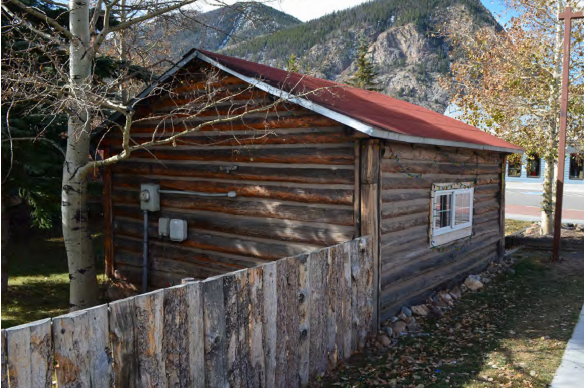
5ST.1763 • Cannam Cabins Cabin 1 Looking Southwest Image: 502a.MAI.4