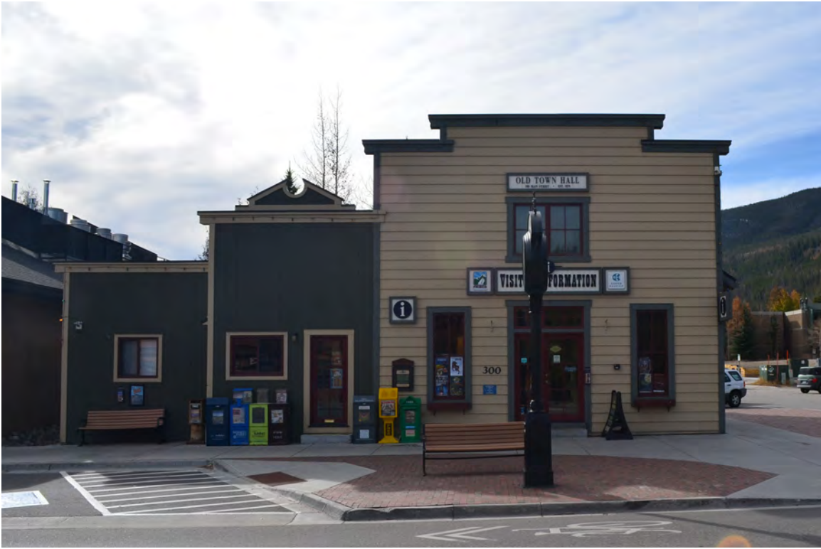
5ST.1073 • Historic Frisco Town Hall Looking South Image: 300.MAI.1