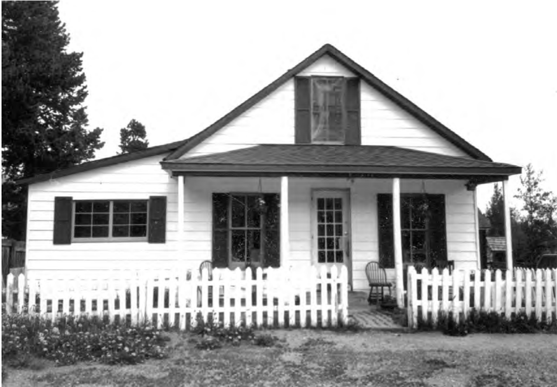
5ST.1757 • Wiley House Looking North Image: 113.GRA.2

Summit County, Colorado Date Unknown