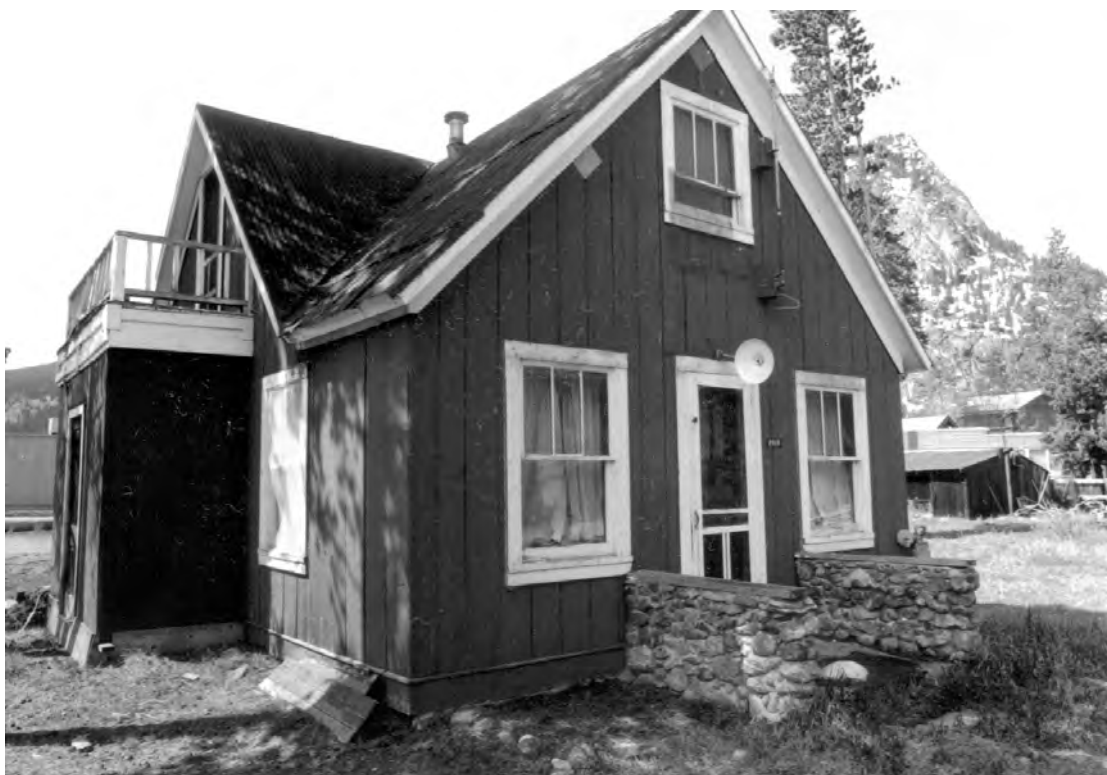
5ST.1766 • Excelsior Mine Office Appears to be looking southwest Image: EXCL.8

Summit County, Colorado date unknown