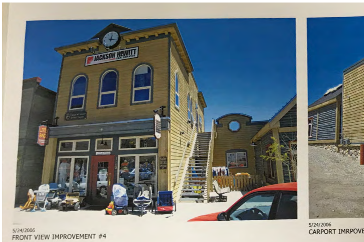
5ST.1760 • Lost Cajun Cafe Associated Buildings Looking East Image: 204.MAI.9

Summit County, Colorado May, 2006