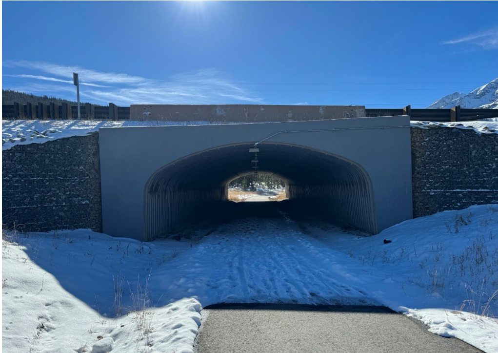
Facade #1: On PRA side

Approximate Facade Measurements- 195 square feet of paintable surface