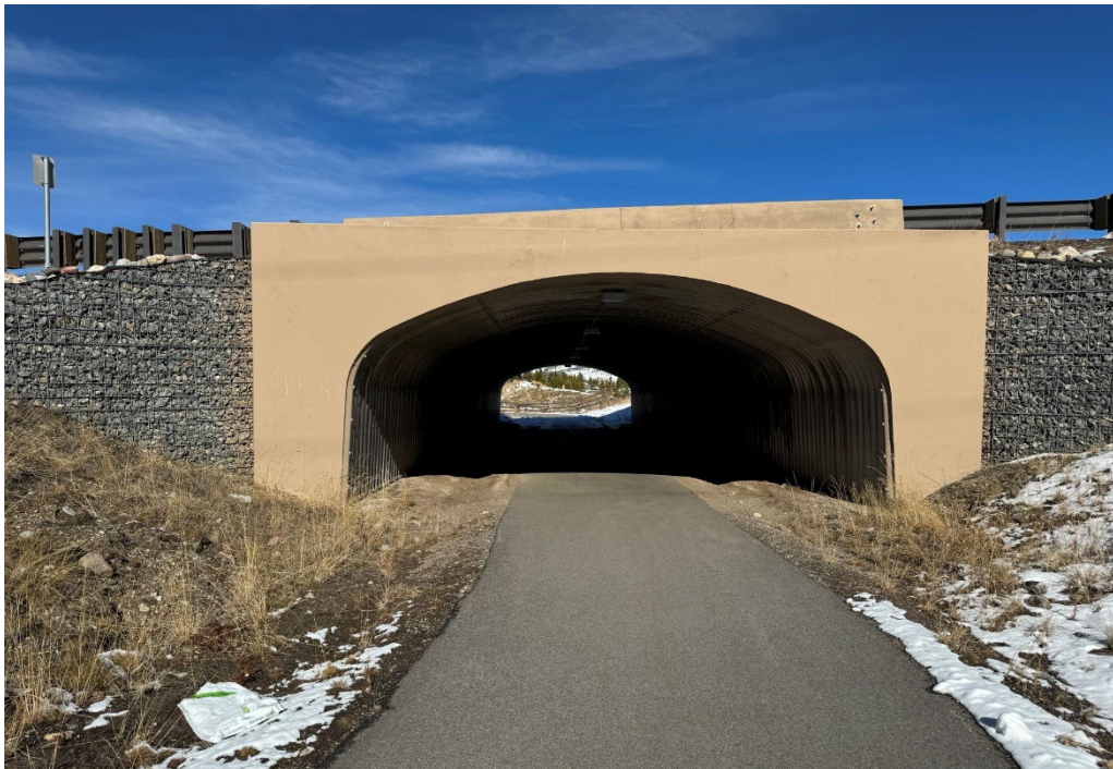
Facade #2: On County Commons Side