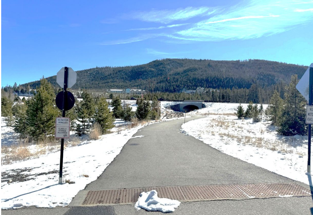
Image 1: Leading Towards the CDOT Tunnel from the Peninsula Recreation Area (PRA)