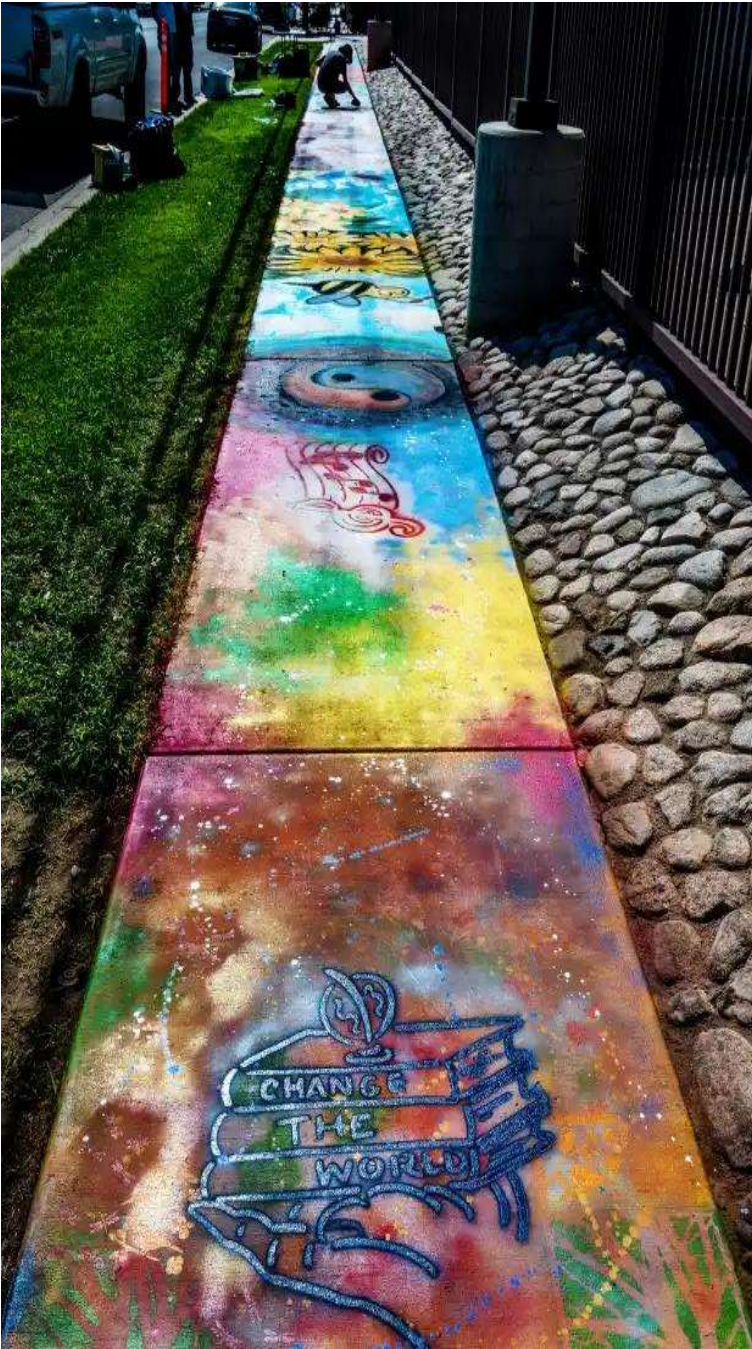
Rancho Cucamonga, CA. acrylic spray paint, themes of resilience, unity, and compassion