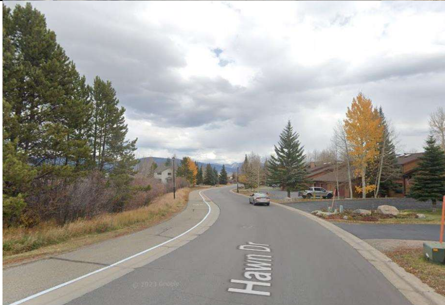
Walking Path #3