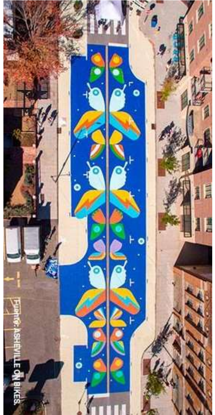
Asheville, NC. Asphalt Art. Micro mobility project