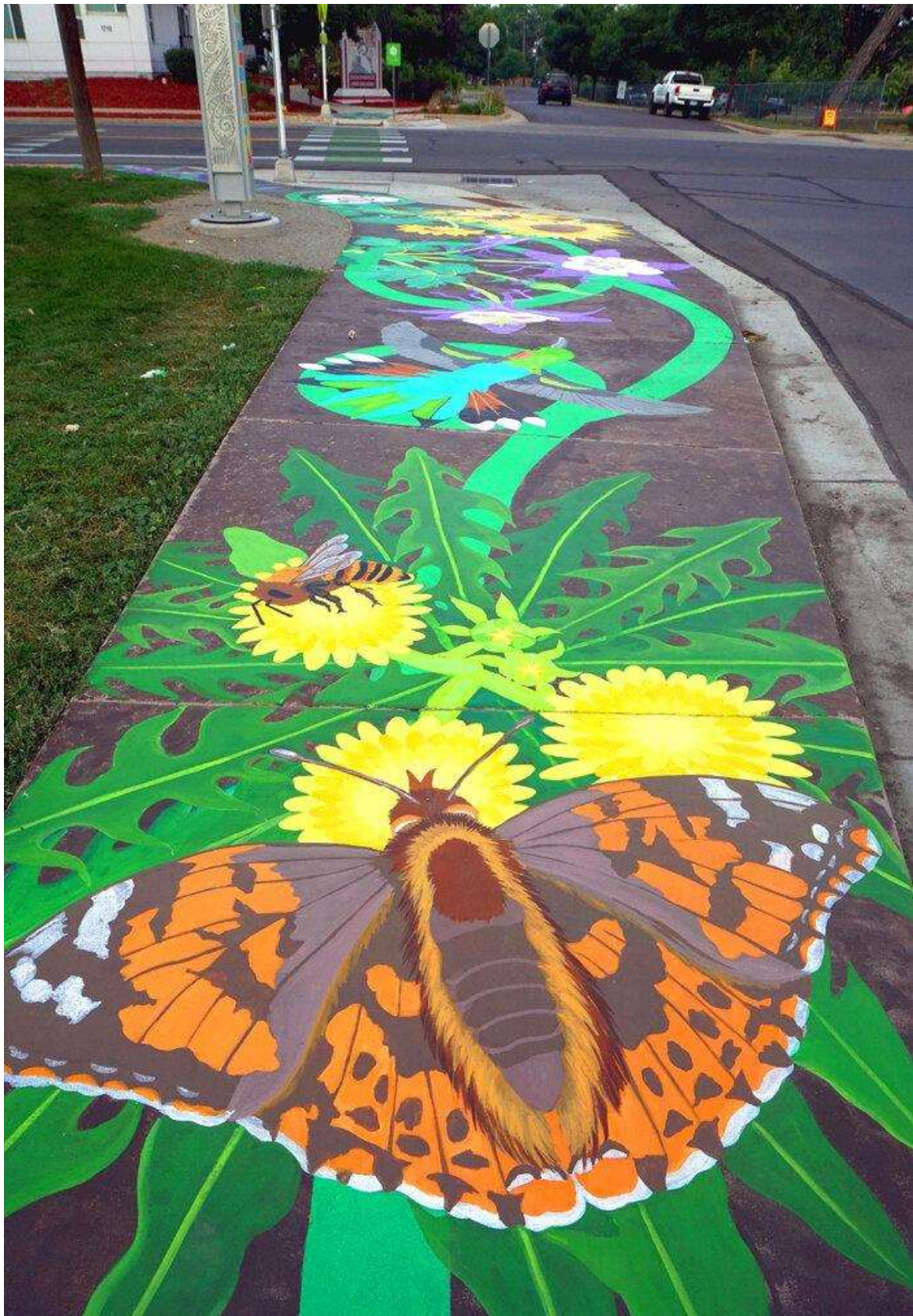
Pollinator Path, Lakewood, Colorado.