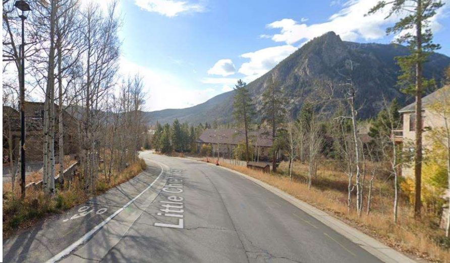
Walking Path #2