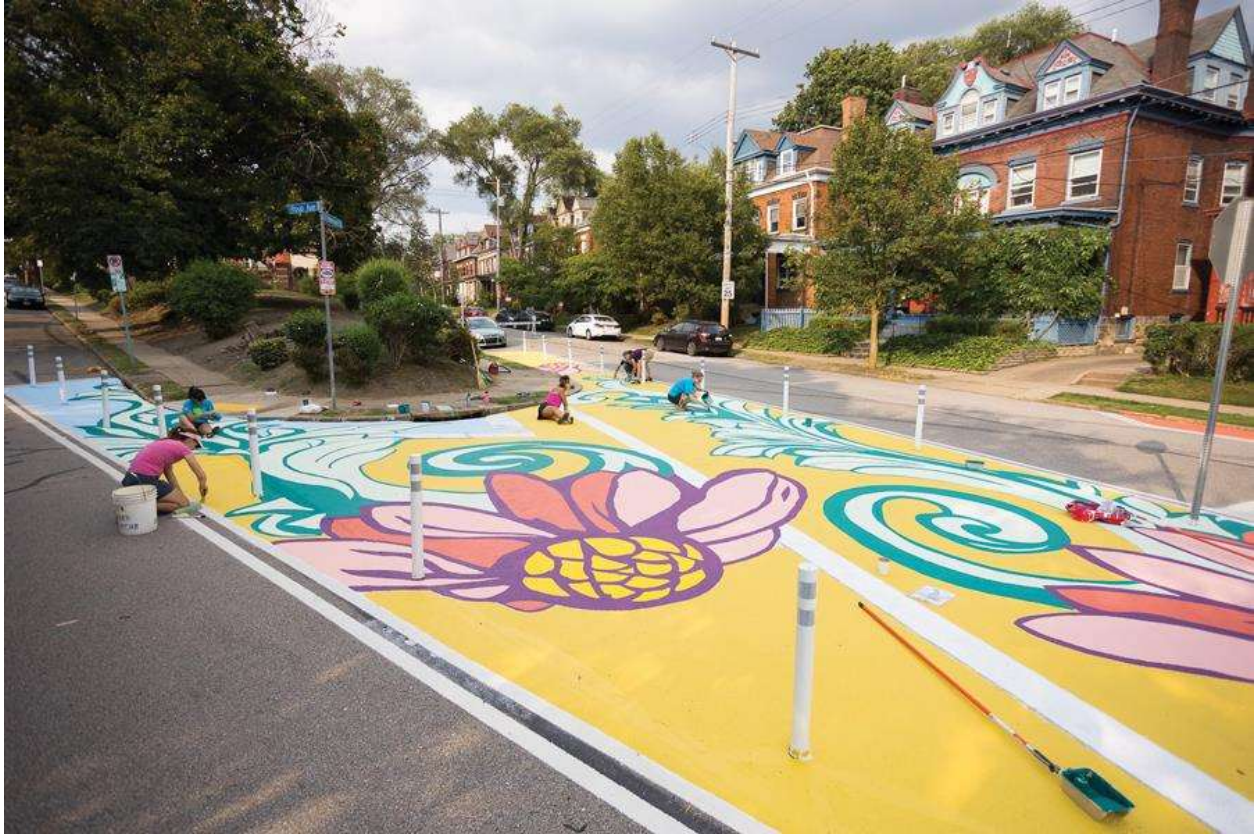
Pittsburgh, PA. 2022. Asphalt Art Initiative. Pavement art slows traffic.