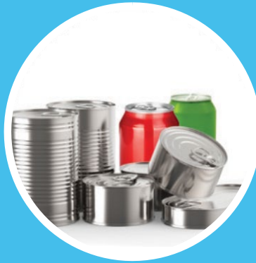
Aluminum & Tin Cans Aluminio y Latas de Metal