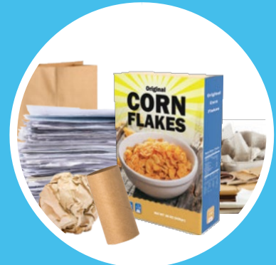
Paper & Cardboard Papel y Cajas de Cartón