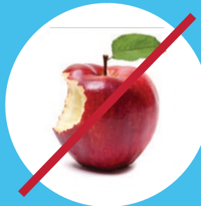
No Food Waste No se permite esechos de Alimentos