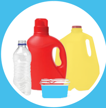
Plastic Bottles, Jugs & Tubs Botellas de Plástico, Jarras y Tarrinas

Bins picked up at your home or office Contenedores de reciclaje recogidos en su casa u oficina