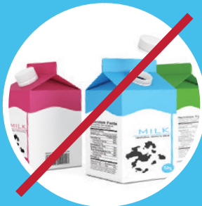
No Cartons No se permite Cartones