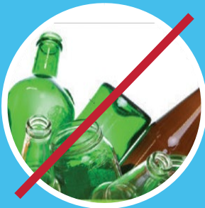
No Glass No se permite Vidrio